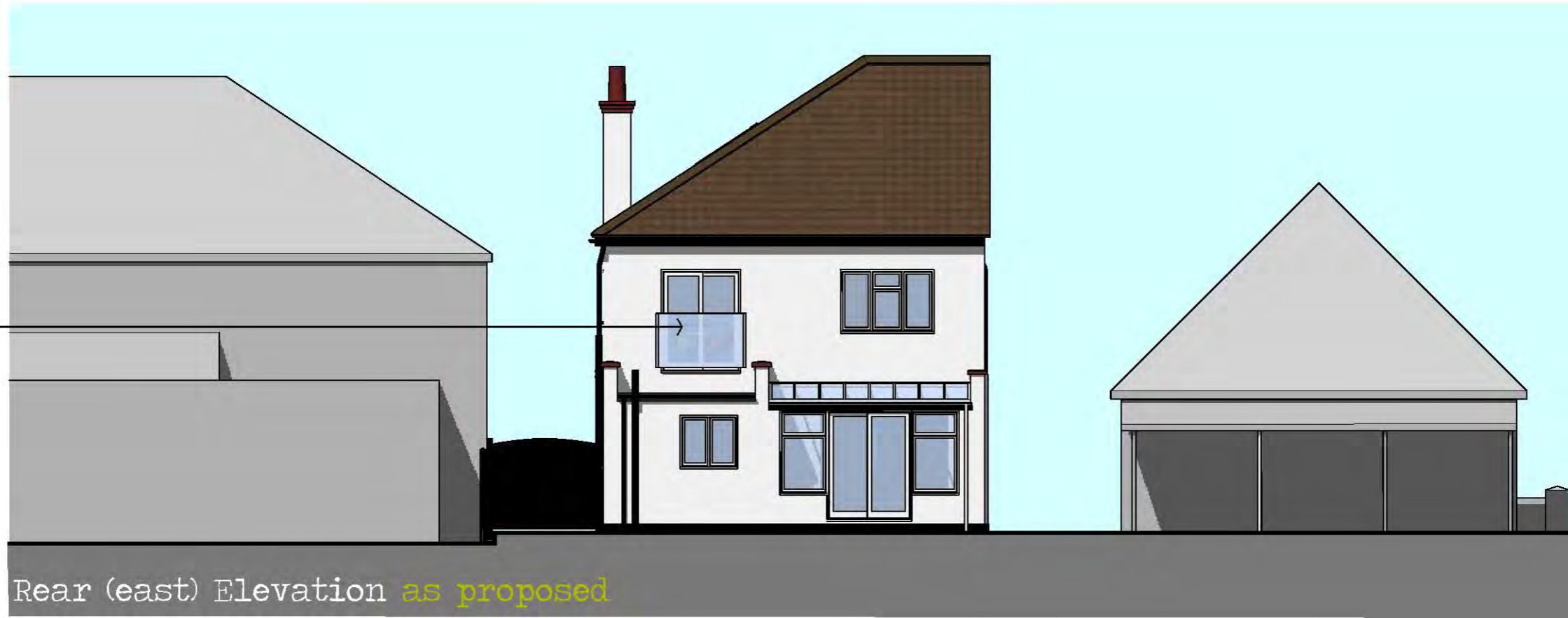
Rear (east) Elevation as proposed

New glass balustrade set in to Anodised aluminium channels fixed either side of existing opening.