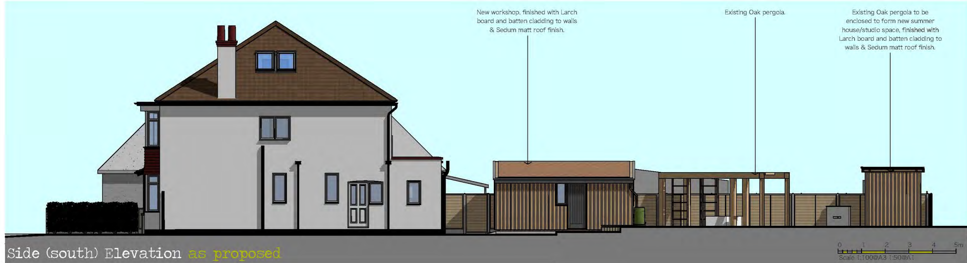
Side (south) Elevation as proposed

Existing Oak pergola to be enclosed to form new summer house/studio space, finished with Larch board and batten cladding to walls & Sedum matt roof finish.